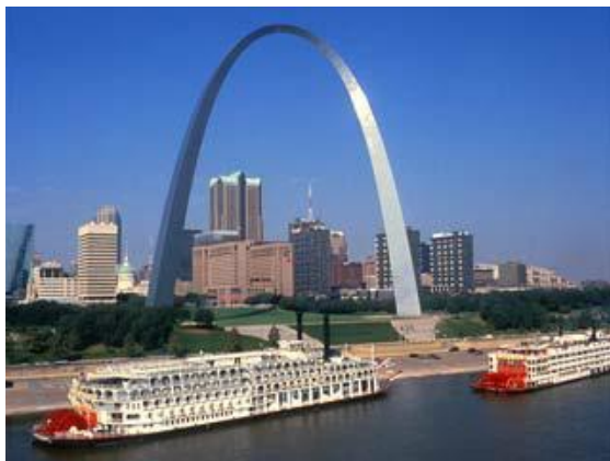
The Gateway Arch